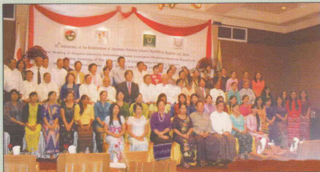
Group photo of Distinguished Guests with Alumni members celebrating the first meeting of Okayama University International Alumni Association (Myanmar Branch) and the MOU signing ceremony between MAJA and Okayama University (19 th August 2014, Park Royal Hotel, Yangon, Myanmar)